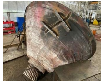
Head MP 1000