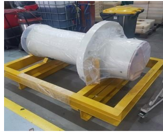
Pinion shaft Primary crusher