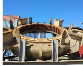
Adjustment ring MP 1000