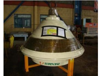
Head MP 1000