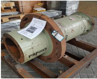
Pinion shaft Primary crusher