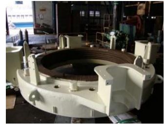
Adjustment ring MP 1000